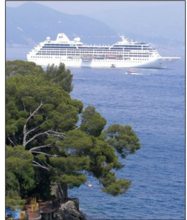
A cruise ship outside Portofino, Italy